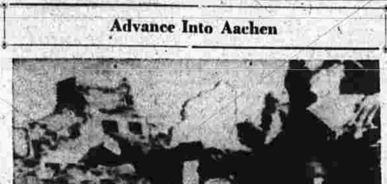
Advance Into Aachen

The J.W. HALE CORP MANCHESTER CONN. Advertise In The Herald—It Pays